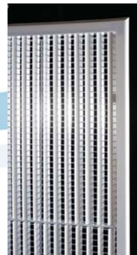
pads, filters & covers