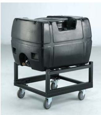
reservoirs & inlets