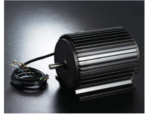
pumps & motors