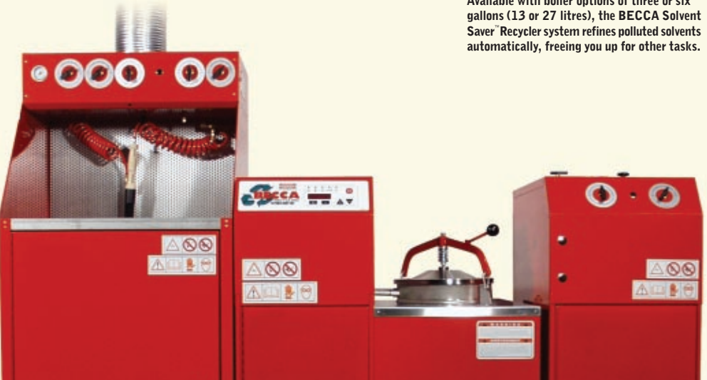
Optional 2nd Spray Gun Cleaning Unit (pictured Next 80)

Available with boiler options of three or six gallons (13 or 27 litres), the BECCA Solvent Saver™ Recycler system refines polluted solvents automatically, freeing you up for other tasks.